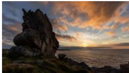
2 nd : Julien Godefroid (parent)