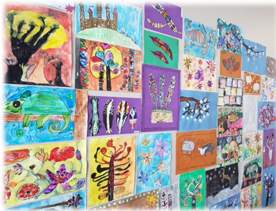
Periscolaire Art Exhibition at the School Fete - (18/05/2019)

"Happiness is not something you postpone for the future; It is something you design for the present " - Jim Rohn