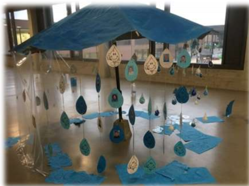
Photo: Lux II - Nursery School -The Water Theme