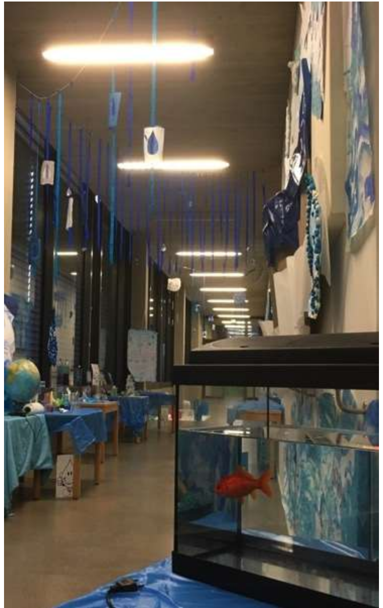
Photo: Lux II - Ecole maternelle - 4 thèmes étudiés (Terre, Feu, Air et Eau) - ici le thème de l'eau

We are pleased to inform you that this year more than 40 secondary students enrolled in the Bronze and Silver levels. More information can be found on: http://www.apeeel2.lu/merite-jeunesse-is-back-in-lux-2/