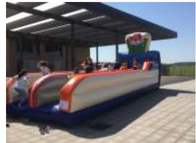
Photo: Lux II - School Fete 2018 - APEEEL2