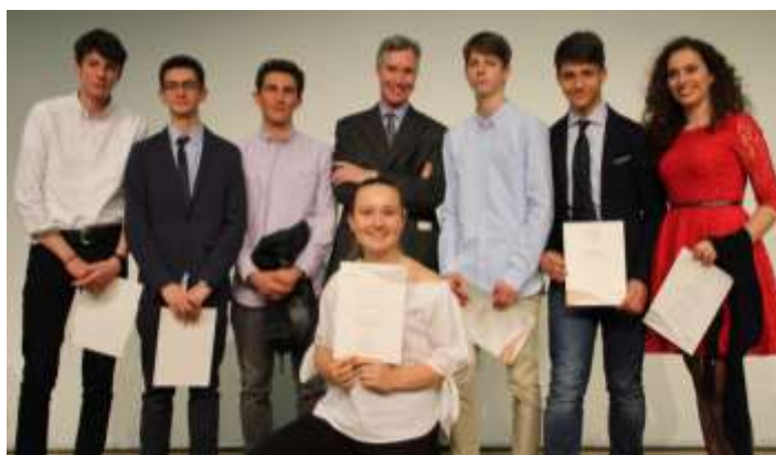
Photo: Some of the Lux II recipients with HRH Prince Guillaume.

Congratulations and well done to everyone!