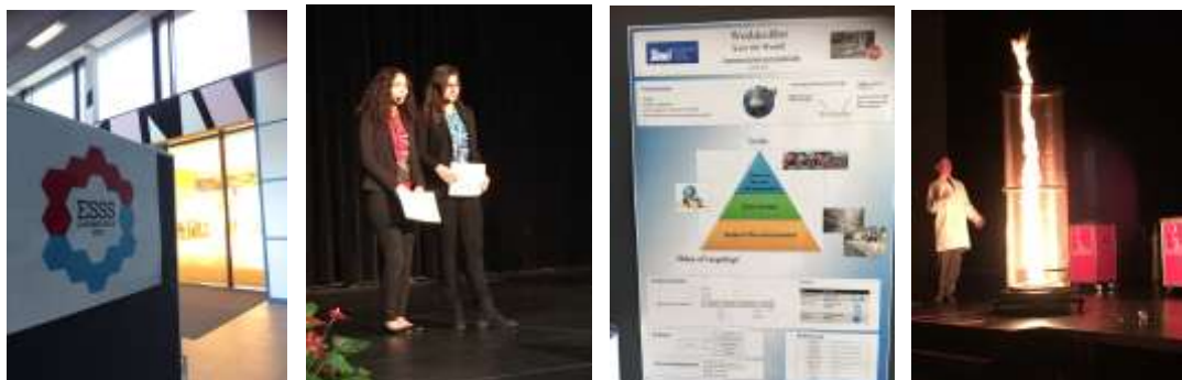
Photos : Moments du Symposium de Sciences à Lux2

L'APEEEL2 est heureuse d'avoir soutenu cet événement et d'avoir fait partie des sponsors. Nous remercions les enseignants qui ont pris en charge toute l'organisation du projet ainsi que la formidable équipe d'élèves volontaires impliqués et présents pendant tout le déroulement du symposium. Nous regrettons cependant le manque de communication autour de cet événement majeur et exceptionnel pour notre Ecole et aurions souhaité que tous les élèves du secondaire se trouvent impliqués d'une manière ou d'une autre en participant à certains moments clés du symposium (cérémonie, présentations des projets, spectacle de physique).