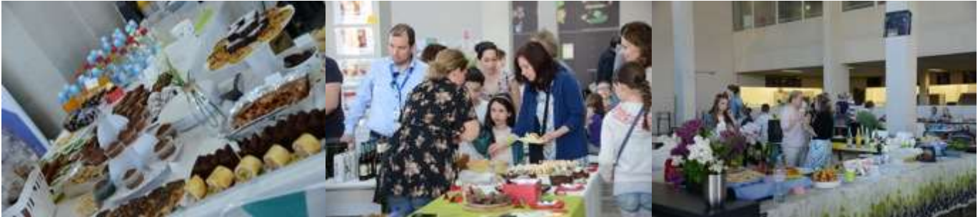
Photo: Lux II - School Fete 2018 - National Stands

We had more than 2600 visitors this year on the school fete. Considering that Lux I. and two EU institutions had their similar events on the same day this is indeed a remarkable attendance and it shows the parents commitment to this event.